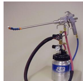
HVLP Spray Gun