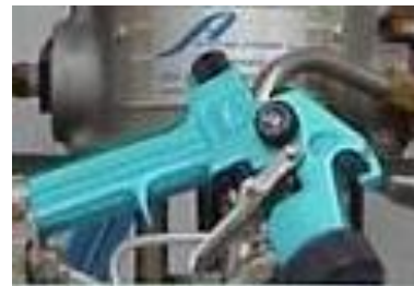
Electro-Static Spray Gun

It is important to ensure that the HVLP, air assisted, airless, 5 Gallon (18.9 Liter) Cart Sprayer, or electrostatic paint gun for applying Calla® 1452 are properly setup for the following reasons below.