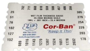
Wet Film Thickness Gauge Fingers

The application thickness of Cor-Ban® 23 Enhanced Dye should be approximately 0.50 mils (13 microns) dry. For measuring the wet film thickness of Cor-Ban® 23 Enhanced Dye , use protection for your hand so that you can push Zip-Chem®'s Wet Film Thickness Gauge as shown below into the Cor-Ban® 23 Enhanced Dye material via hand after the Cor-Ban® 23 Enhanced Dye has been allowed to flow for a few minutes.