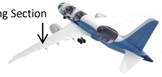
Center Wing Section