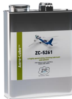
ZC-5261 1 Gallon (3.8 Liter) Can

For application questions regarding the D-5261NS/ZC-5261, contact Zip-Chem® Aviation Products at (1) 408 782 2335 or zipchem@addevmaterials.com