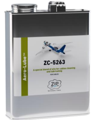
ZC-5263 1 Gallon (3.8 Liter) Can →

For application questions regarding the D-5263NS/ZC-5263 , contact Zip-Chem® Aviation Products at (1) 408 782 2335 or zipchem@addevmaterials.com