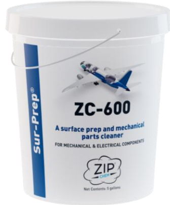
ZC-600 1 Gallon (3.8 Liter) Unit →

For application questions regarding the D-5600NS/ZC-600, contact Zip-Chem® Aviation Products at (1) 408 782 2335 or zipchem@addevmaterials.com.