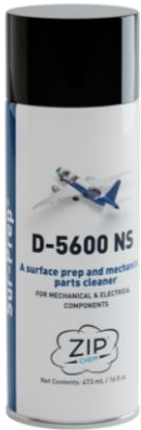
← D-5600NS 16 fl oz (473 mL) Aerosol