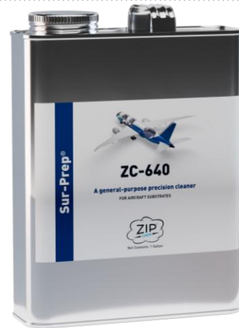
ZC-640 1 Gallon (3.8 Liter) Pail →

For application questions regarding the D-5640NS/ZC-640, contact Zip-Chem® Aviation Products at (1) 408 782 2335 or zipchem@addevmaterials.com.