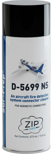
← D-5699NS 16 fl oz (473 mL) Aerosol

* Formit® Sample Pack (3 each of Formit®-18-Fan , Formit®-18-180 , Formit®-18-360 , Formit®-18-STD-FOG-100107 )