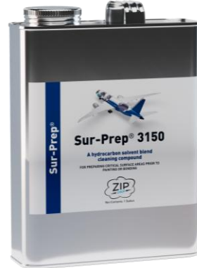
Sur-Prep® 3150 1 Gallon (3.8 Liter) Can →

..... For application questions regarding the Sur-Prep® 3150, contact Zip-Chem® Aviation Products at (1) 408 782 2335 or zipchem@addevmaterials.com.