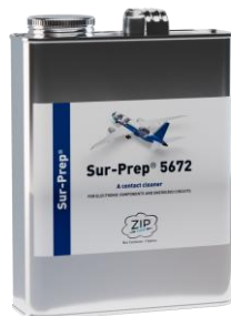
← Sur-Prep® 5672 1 Gallon (3.8 Liter) Can

Sur-Prep® 5677 NSN: 6850-01-684-6911 (16 fl oz (473 mL) Aerosol)