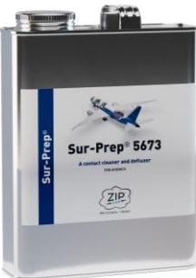
Sur-Prep® 5673 1 Gallon (3.8 Liter) Can

Sur-Prep® 5677 NSN: 6850-01-684-6911 (16 fl oz (473 mL) Aerosol)