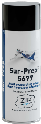
← Sur-Prep® 5677 NSN: 6850-01-684-6911 16 fl oz (473 mL) Aerosol