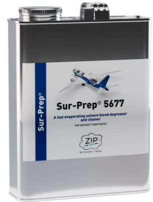
Sur-Prep® 5677 → 1 Gallon (3.8 Liter) Can

For application questions regarding the Sur-Prep® 5677 , contact Zip-Chem® Aviation Products at (1) 408 782 2335 or zipchem@addevmaterials.com.