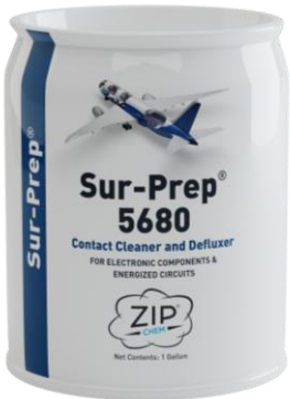
← Sur-Prep® 5680 1 Gallon (3.8 Liter) Can

Formit® NSN's: 4730-01-612-9914, NSN: 4730-01-661-8773 (Formit®-18-Fan); 6850-01-492-2942 (Formit®-18-360); 4730-01-632-0156 (Formit®-18-STD-FOG) 1560-01-658-8943 (with metal sleeve), 4730-01-659-5461 (without metal sleeve) (Formit®-48-360) 4730-01-632-0157 (Formit®-48-Fan)