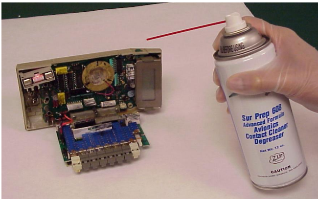
Preparing To Spray Sur-Prep® 608 on electronic components