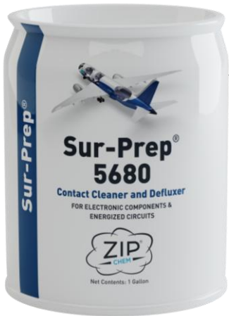
← Sur-Prep® 5680 1 Gallon (3.8 Liter) Can Sur-Prep® 5680 16 fl oz (473 mL) Can →

Formit® NSN's: 4730-01-612-9914, NSN: 4730-01-661-8773 (Formit®-18-Fan); 6850-01-492-2942 (Formit®-18-360); 4730-01-632-0156 (Formit®-18-STD-FOG); 1560-01-658-8943 (with metal sleeve), 4730-01-659-5461(without metal sleeve) (Formit®-48-360); 4730-01-632-0157 (Formit®-48-Fan)