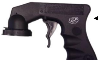
Zip-Chem® Aerosol Trigger Sprayer