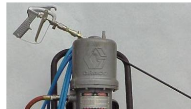
Airless Spray Equipment